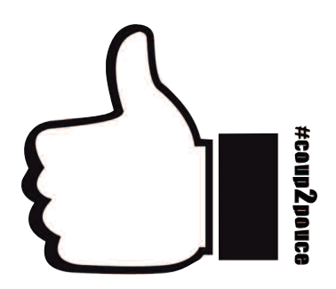
Many celebrities have given their support to Alternatiba Tour. #coup2pouce