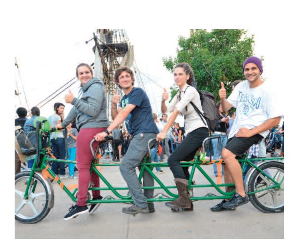
The Alternatiba volunteers on the 4-seat bicycle.

The reggae band "The Gladiators" on the symbolic 4-seat bicycle, July 2014.